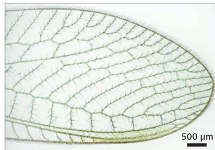
Green lacewing Transmitted light bright field