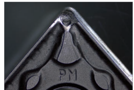
Indexable insert, shows tool wear. Reflected light, ringlight, zoom 0.8x